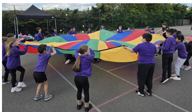
Year 3 visited Chiltern Hills Academy to take part in their tennis festival this term.

Find out all about our learning over the last half term at Ivingswood Academy.